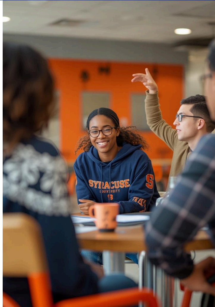
Photographs represent proposed spaces and are not actual.